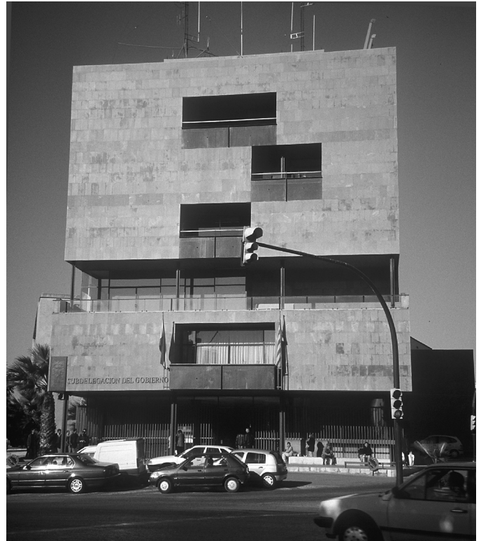
Fig. 6. Civil Government building, Tarragona, Spain, designed by architect Alejandro de la Sota, built 1956-1961.