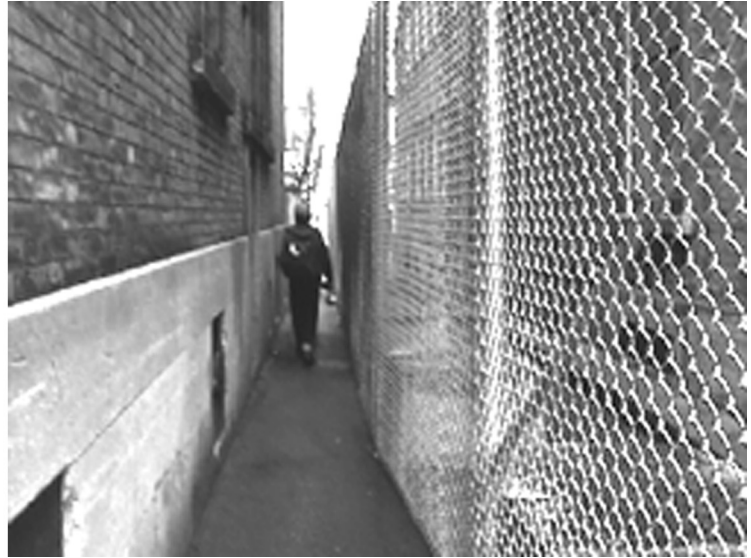
Fig. 3, 4. Plan drawn by citizen's group, and view of temporary fence of chain-link on concrete traffic barrier erected around the downtown conference meeting site during the Summit of the Americas, Quebec City, Canada, in April 2001.