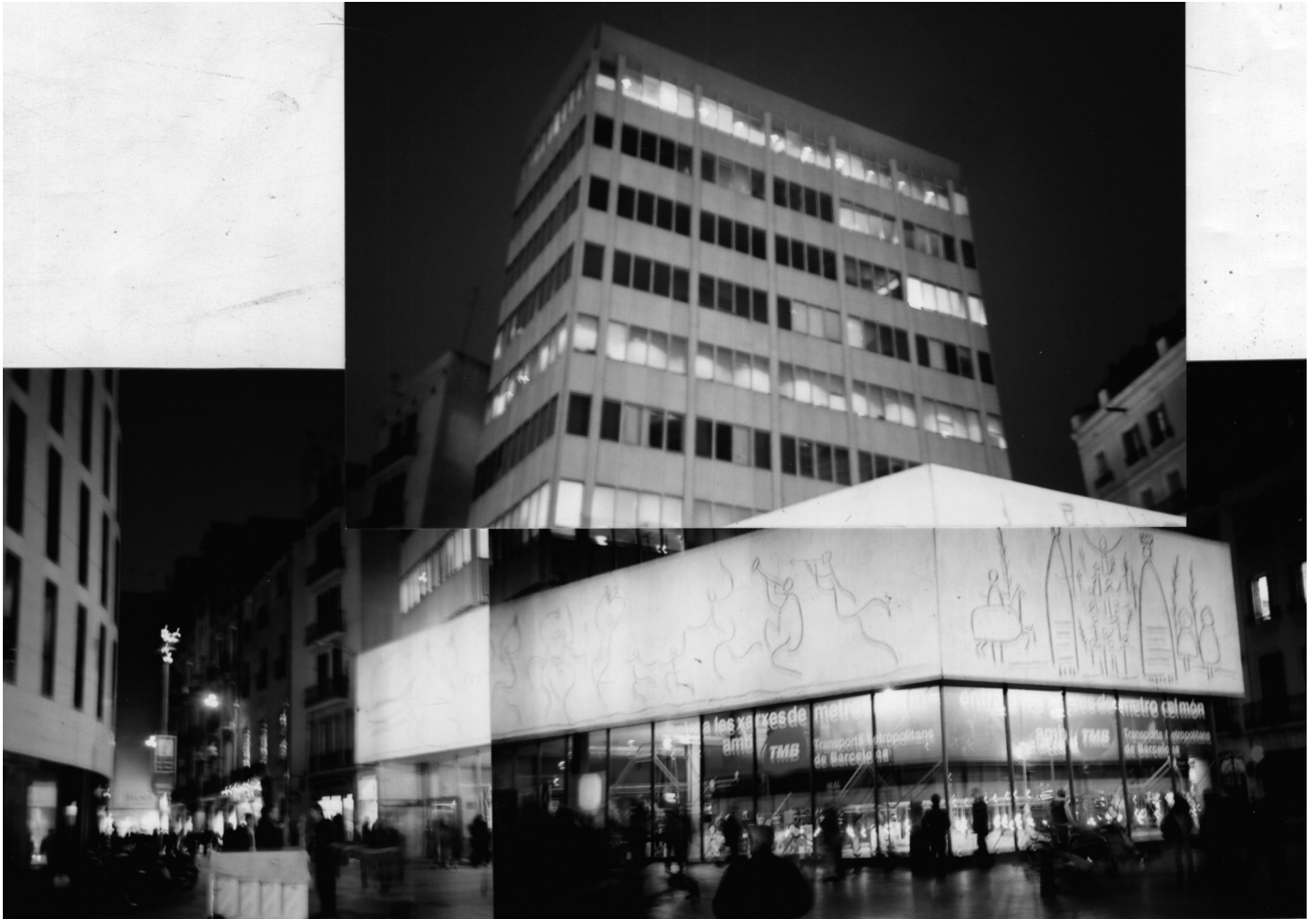
Fig. 7. Colegio de Arquitectos de Cataluña in Barcelona, Spain, architect Xavier Busquets, built 1961.

Neimeyer, and Sven Markelius after a collaborative design workshop in which key formal proposals were elaborated by an international selection of architects. Masterworks of the mid-century, they can also be perceived impregnable, bureaucratic fortresses. The United Nations building presides at the river's edge, overlooking the Manhattan waterfront and providing a modern microcosmic landscape, complete with its distinctive 38 storey slab tower. It presents a riverfront face to the city, viewed from across the East River, it embodies the sophistication of its global mission. Breuer's UNESCO building, while similarly sculptural, occupies a complete block and is perceptible as an object in the round. It is the more bureaucratic looking, and its entrance is somewhat inscrutable. As symbolic headquarters, both structures are deteriorating. Their architecture and urban insertion, as well as the institutions themselves, are currently in dire need of refurbishment. At the time of their completion, they were examples of an architectural vocabulary aspiring to the universal by means of symbolic, pure geometries, functioning at the global scale with expressive architectural