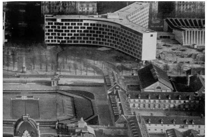
Fig. 9. UNESCO headquarters in Paris, France, designed by office of Marcel Breuer, 1959.

form, but with more attention paid to the rites and ceremonies of world governance, and little to street-oriented expression of political will.