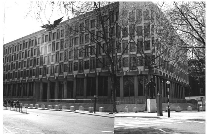
Fig. 5. American Embassy, Grosvenor Square, London, designed by Eero Saarinen, built 1955-61.

as wishing for a rather larger-scaled of the figural eagle sculpture, and mildly refuted the critique, "the building is much better than the English think — and not quite as good as I wished it to be". 3