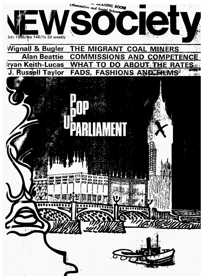
Fig. 1. Cedric Price, Pop Up Parliament , project, published in New Society , July 1965.

raised in the discourse of globalization, in contemporary western society there is a functional need for prototypical public space and buildings with a degree of openness and intimacy, where expression of political opinion can take place in a spontaneous way. In the western democracies it is likely that the kinds of control exercised in allowing political demonstrations will affect numbers, if only from a practical perspective. The smaller, carefully organized, issue-oriented pacifist demonstrations would seem to present a more effective strategy than mass large scale demonstrations with potentially unforeseen consequences. For this reason, more intimately scaled examples could provide useful precedents.