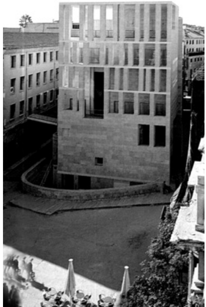
Fig. 8. Municipal Building, Murcia, Spain, architect Rafael Moneo.

A literal example of a political face of a building can be found in Havana, where the face of Ernesto Che Guevara looms over the expanse of the Plaza Cívica . His features are outlined at colossal scale in metal attached to the stone of the Office of the Comptroller building of 1953, now the Ministry of the Interior Building. Described by Eduardo Luis Lopez as one of the finest